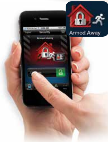
Same graphic icons as Tuxedo Touch!